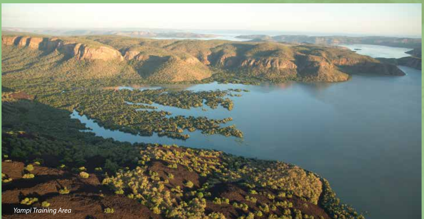
Yampi Training Area

"The work we hope to be undertaking with AWC will build our skills base – and help to preserve the future of the area, consistent with our healthy country plan."