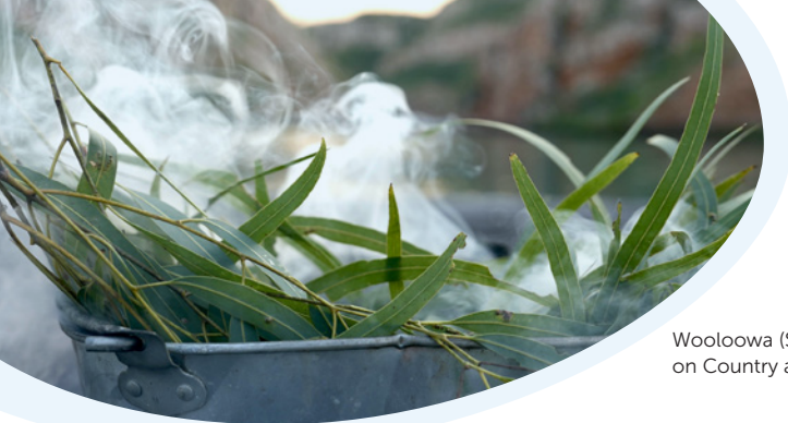
Wooloowa (Smoking Ceremony) on Country at Garaan-ngaddim.